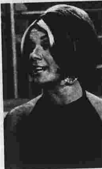
Vikki Carr is a guest on CBS' "The Jim Nabors Hour" Thursday 8-9 p.m.