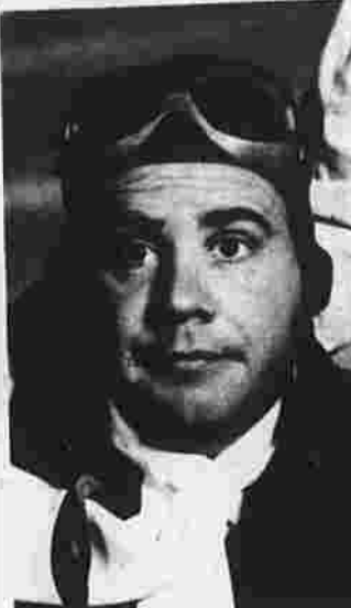
Tim Conway is the star of the new comedy series, "The Tim Conway Show," Friday 8-8:30 p.m. on CBS.