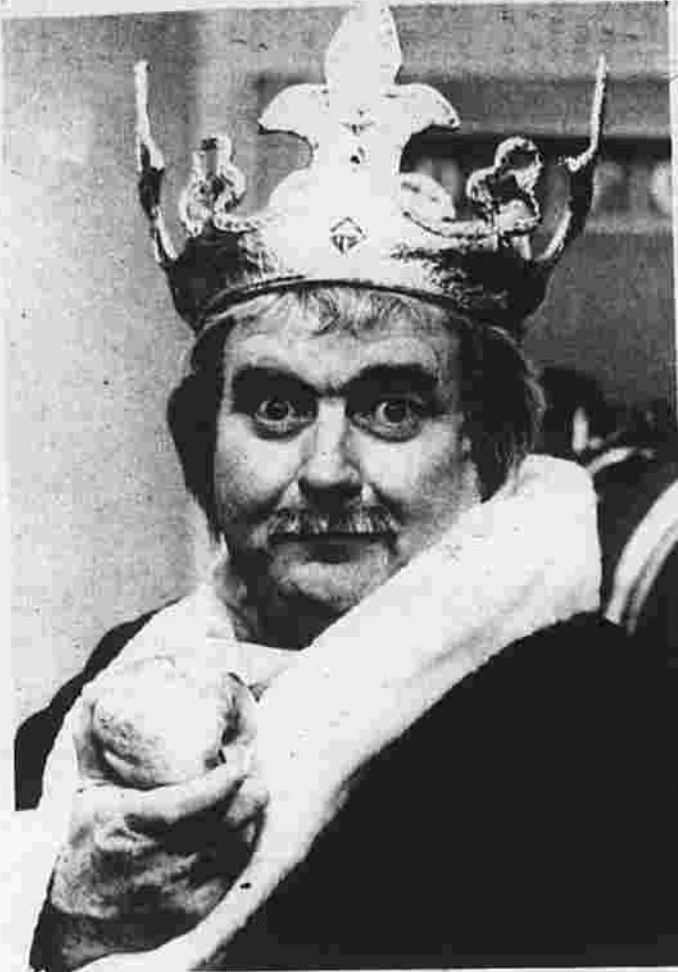
Captain Kangaroo (Bob Keeshan) plays a king in a short play on his show, Wednesday 8-9 a.m. on CBS.